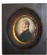
#17 Oils on Paper