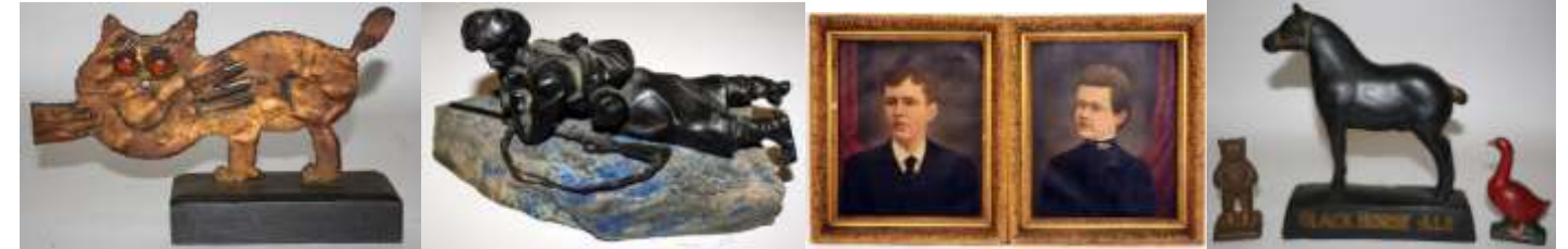
Bronze Arab Soldier