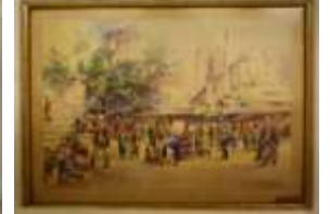
#6 N. Sarafanov