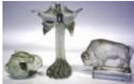
2 Steuben & 1 Lalique