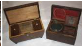
Two English Tea Caddies