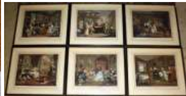
Set of 6 Engravings by Cook