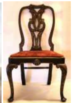
Queen Anne 1 of 5