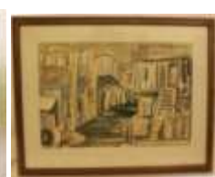
#12 Yossi Stern