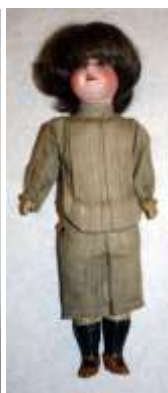
A.M. 370 - 26"