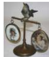
2 Cold Painted Bronzes