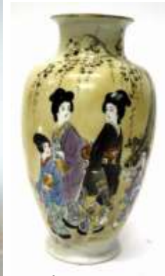
19 th C Vase