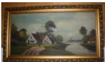
#19 Illegible Signature