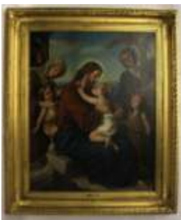
#2 Eduard Steinbruck