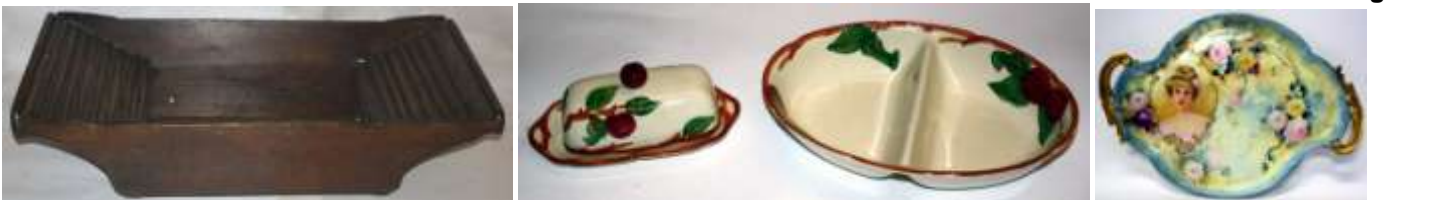
Early Primitive Wash Tub