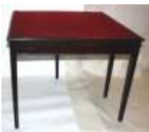
Mahogany Game Table