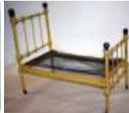
Brass & Iron