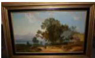
#1 Charles Baker

To see many more detailed photographs go to WWW.AUCTIONZIP.COM , auctioneer #1162