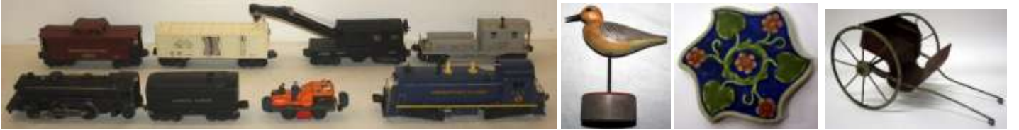
Over 50 pieces of Lionel trains