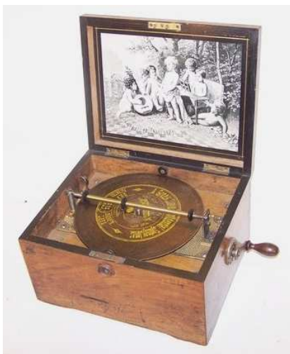
11 DISC MUSIC BOX