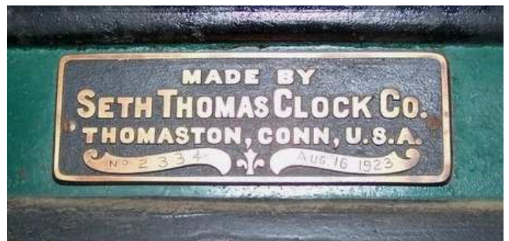
PLATE ON TOWER CLOCK STAND