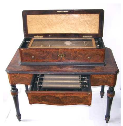
36-TUNE MUSIC BOX