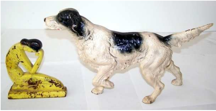
TWO CAST IRON DOOR STOPS