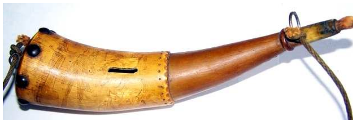
EARLY POWDER HORN INCISED W INDIAN AND DEER