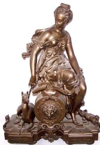
30" HIGH DIANE