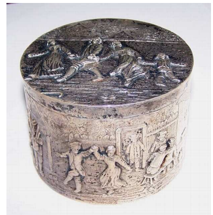
SMALL SILVER BOX