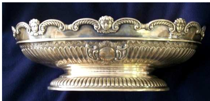
STERLING, ENGLISH, OVAL BOWL, 35.5 TROY OZ