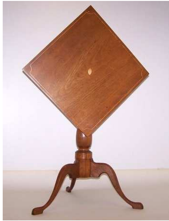
ONE OF 3 TILT-TOP TABLES