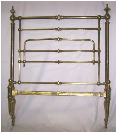
PR FRENCH BRASS BEDS