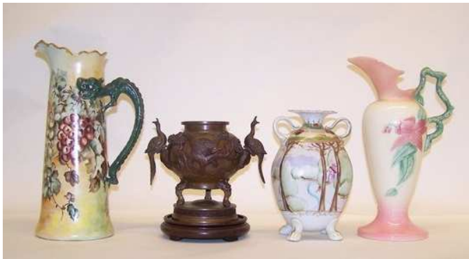
NIPPON AND CHINESE BRONZE