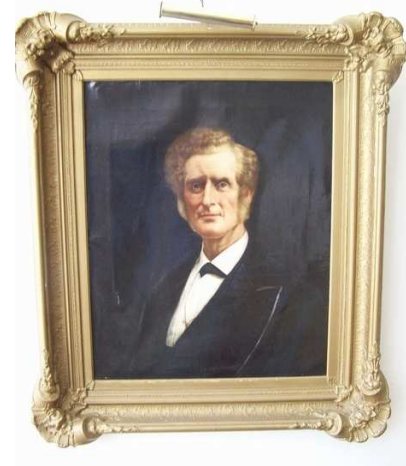
OIL ON CANVAS