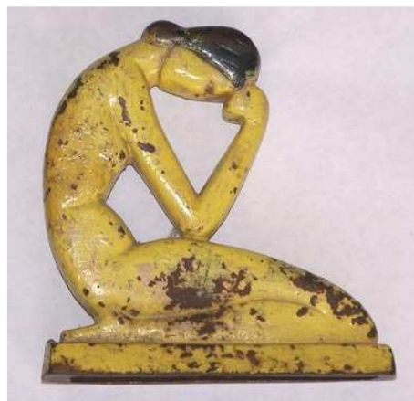
ART DECO NUDE DOORSTOP