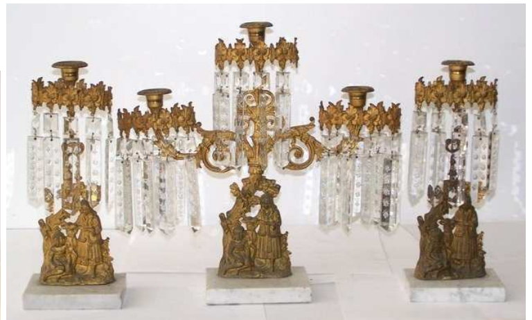
3-PIECE GIRANDOLE SET