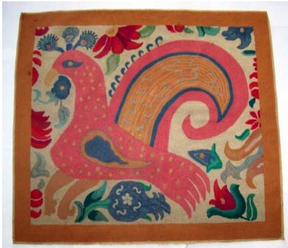
HOOKED RUG, DISTELFINK, 42" x 39"