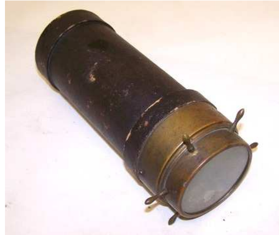
19 TH CENTURY KALEIDOSCOPE