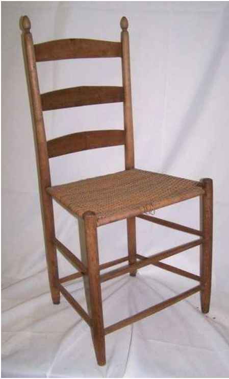
SET OF 4 SHAKER CHAIRS W TILTERS