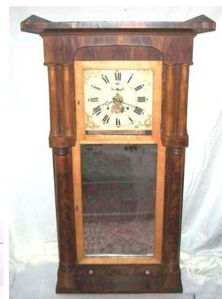
56" ABNER JONES ?