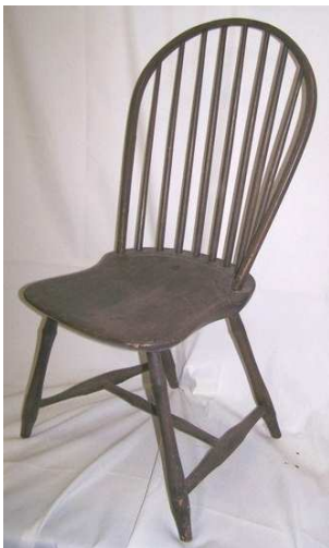
4 HOOP BACK CHAIRS