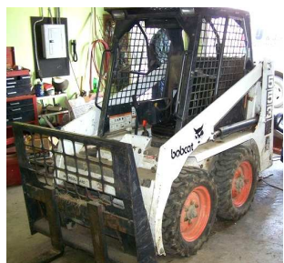
BOBCAT 553 SKID-STEER