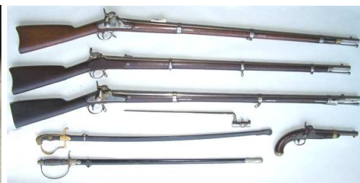
CIVIL WAR GUNS & NAZI SWORDS