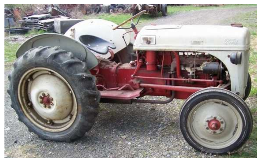
8N FORD TRACTOR