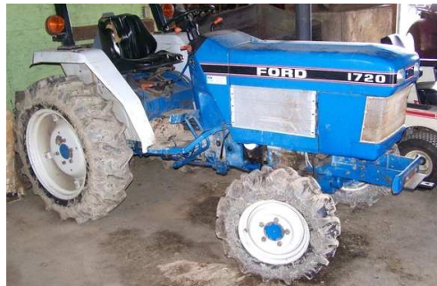
FORD 1720 4-WHEEL DRIVE