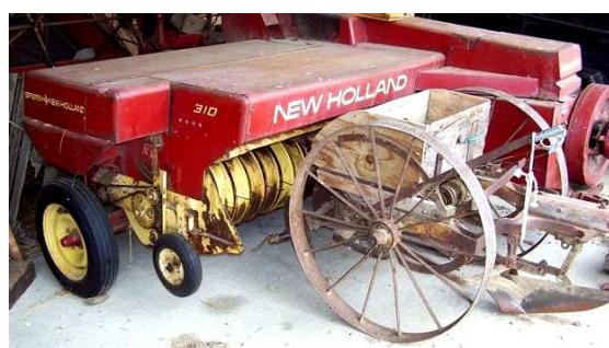
NEW HOLLAND HAYLINER W CHUTE