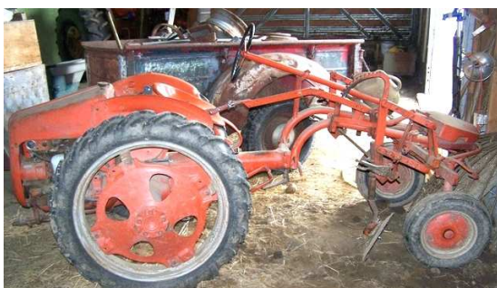
ALLIS-CHALMERS MODEL G