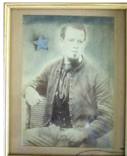
CIVIL WAR NCO