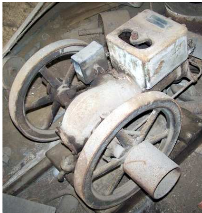
HIT & MISS ENGINE