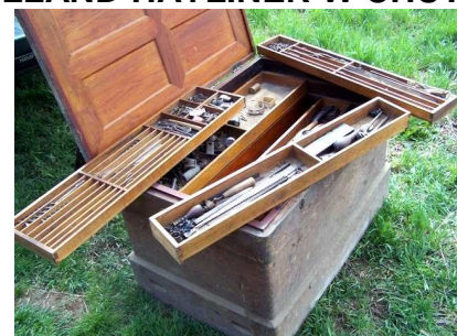
19th CENTURY TOOL BOX