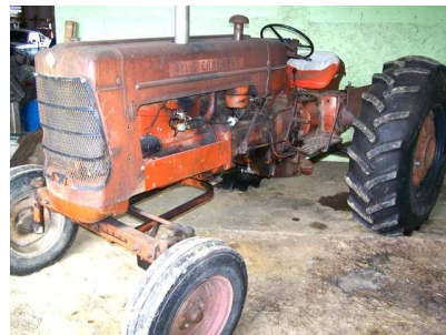
A-C 1959 D-17 TRACTOR