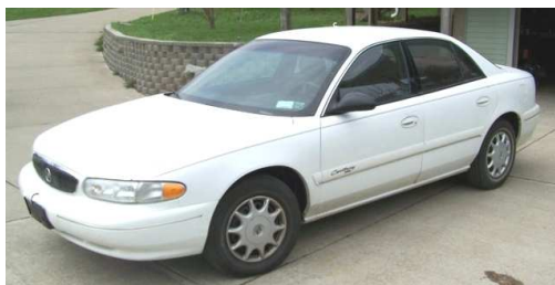
1998 BUICK CENTURY