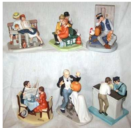
NORMAN ROCKWELL FIGURES