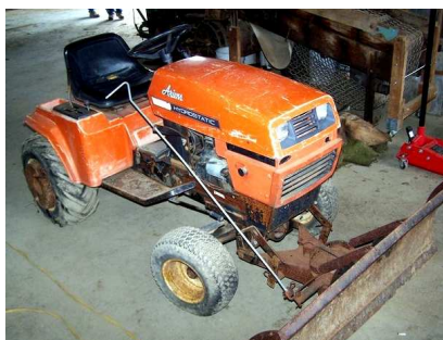
ARIENS - 16 HP