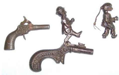
TOY CAP PISTOLS