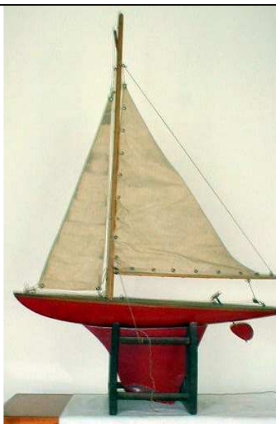
24" POND SAIL BOAT, 1930