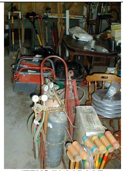
ITEMS IN GARAGE